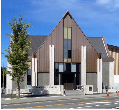
KNOX CHURCH love faith outreach community justice